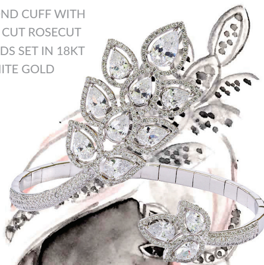
A DIAMOND CUFF WITH SPECIAL CUT ROSECUT DIAMONDS SET IN 18KT WHITE GOLD

“Though she be but little, she is fierce!”