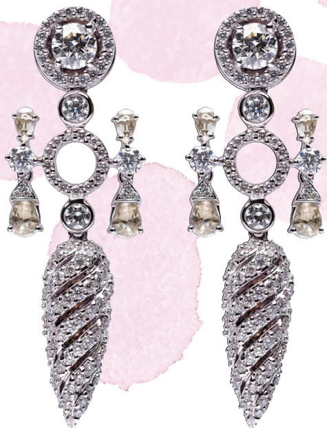
A PAIR OF DIAMOND EARRING WITH HALF CARATS ROUND SHAPED DIAMOND AS CENTER STONE AND SPECIAL CUT ROSECUT DIAMONDS SET IN 18KT WHITE GOLD