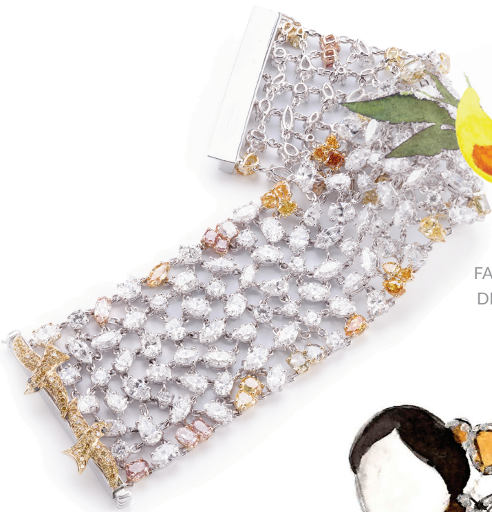
MIX SHAPED DIAMOND EARRING WITH RARE FANCY YELLOW, PINK, ORANGE AND GREEN COLOR DIAMOND SET IN 18KT WHITE AND YELLOW GOLD AND A TOTAL DIA WT 48.19 CTS