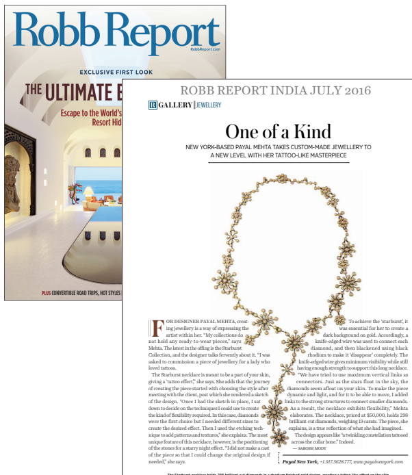
ROBB REPORT INDIA, JULY 2016