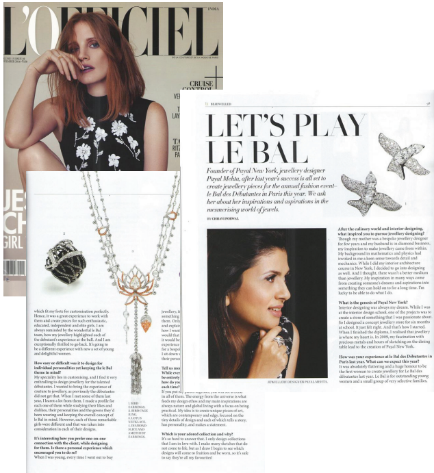
L'OFFICIEL INDIA, OCTOBER 2016