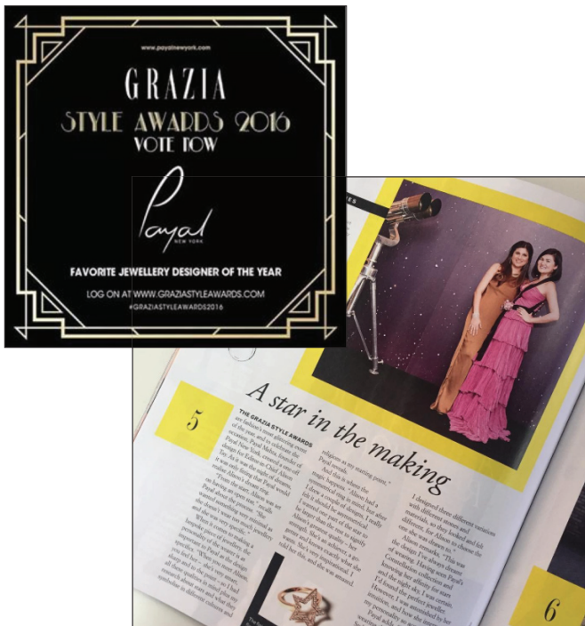
GRAZIA STYLE AWARDS, APRIL 2016