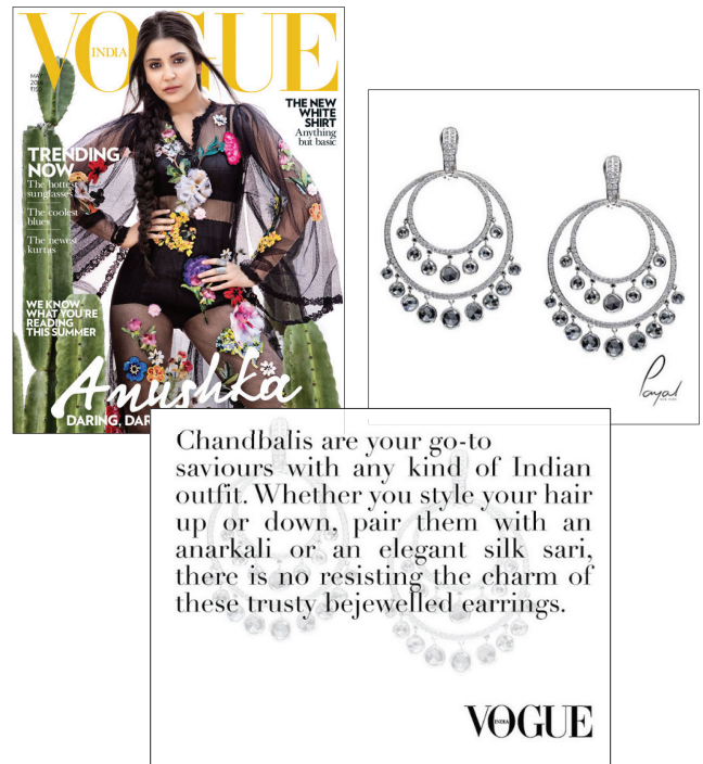
VOGUE INDIA, MAY 2016