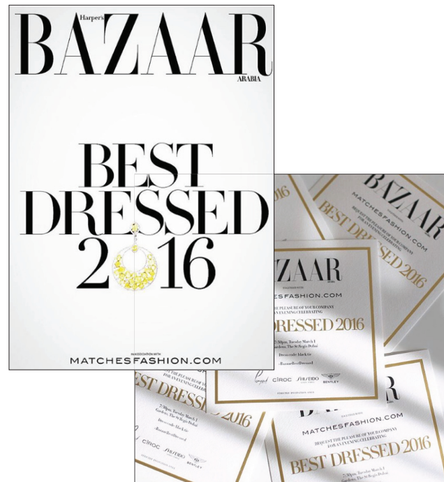
BAZAAR ARABIA COVER, JULY 2016