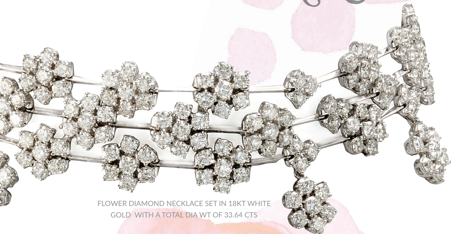
FLOWER DIAMOND NECKLACE SET IN 18KT WHITE GOLD WITH A TOTAL DIA WT OF 33.64 CTS