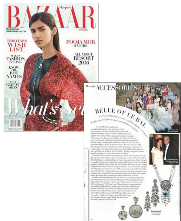
AHLAN!, MARCH 2016