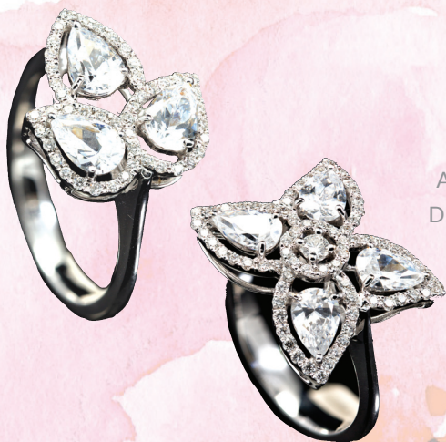
A THREE LEAF AND FOUR LEAF ROSECUT DIAMOND RING SET IN 18KT WHITE GOLD