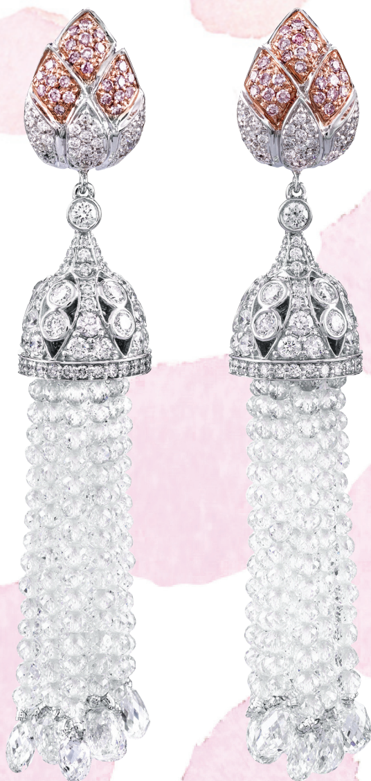
A PAIR OF DIAMOND EARRING WITH PINK DIAMOND, DIAMOND BEADS AND BRIOLLETS SET IN 18KT WHITE GOLD