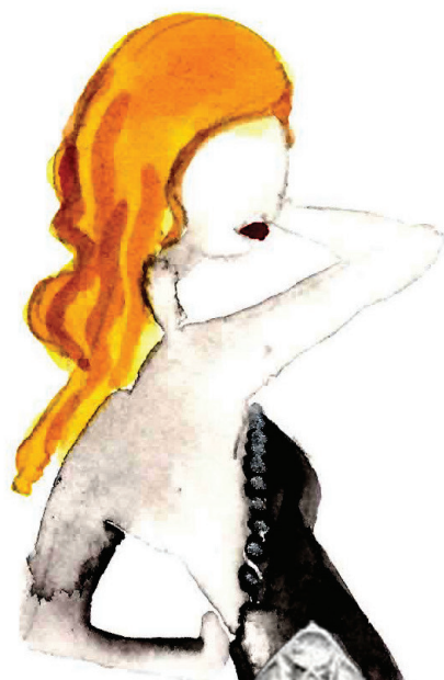
A PAIR OF WATERFALL DIAMOND EARRING SET IN 18KT WHITE GOLD