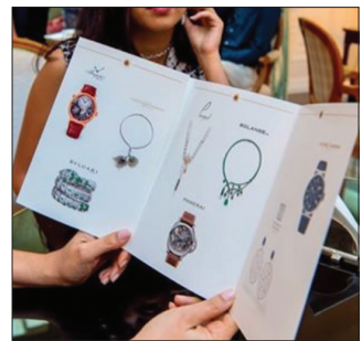
FINE ART OF HIGH JEWELRY AND TIME LOUVRE, JULY 2016