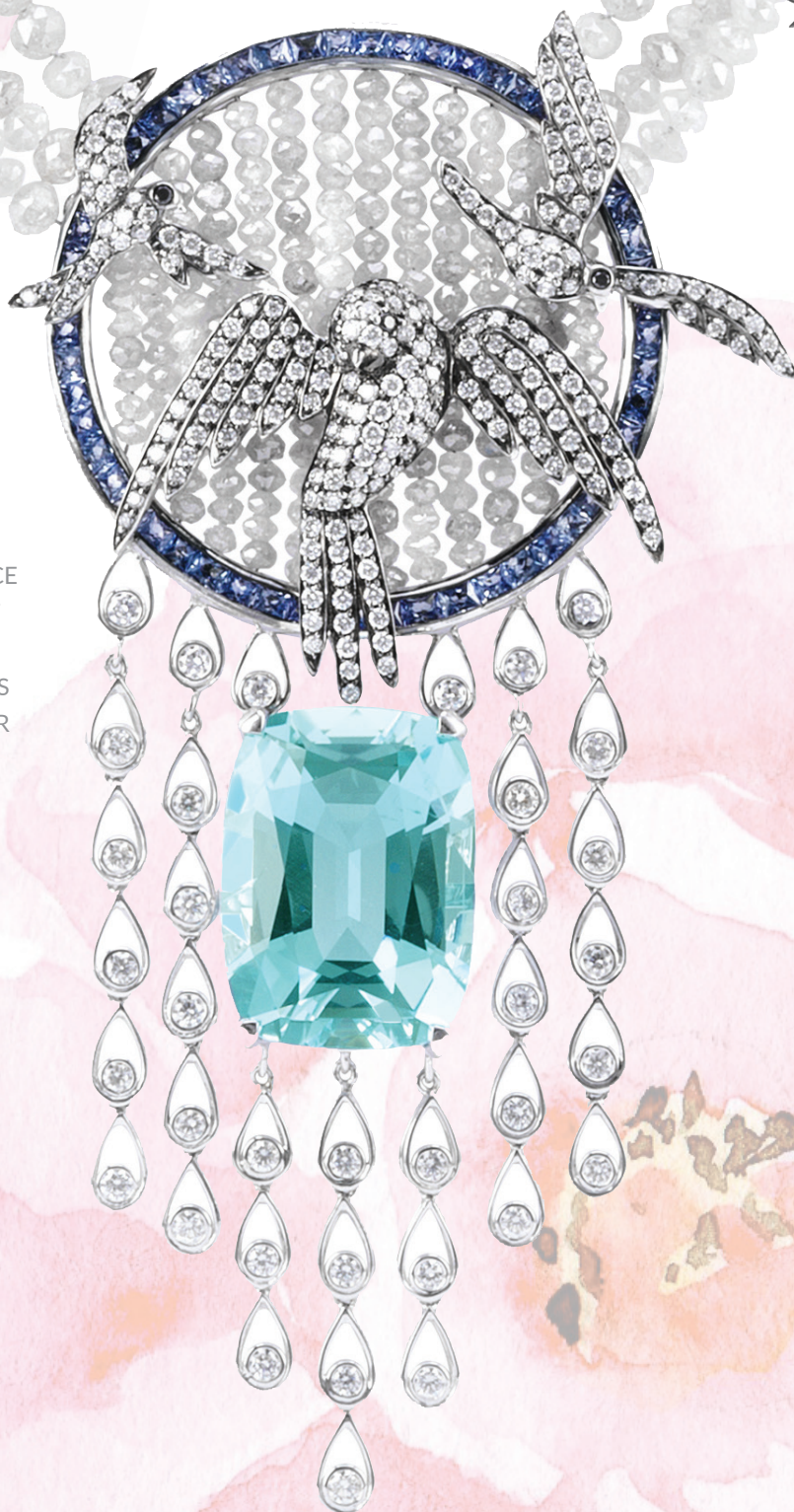
BIRD DIAMOND NECKLACE WITH 108.24 CTS MILKY DIAMOND BEADS, BLUE SAPPHIRE AND 19.03 CTS AQUAMARINE AS CENTER PIECE SET IN 18KT