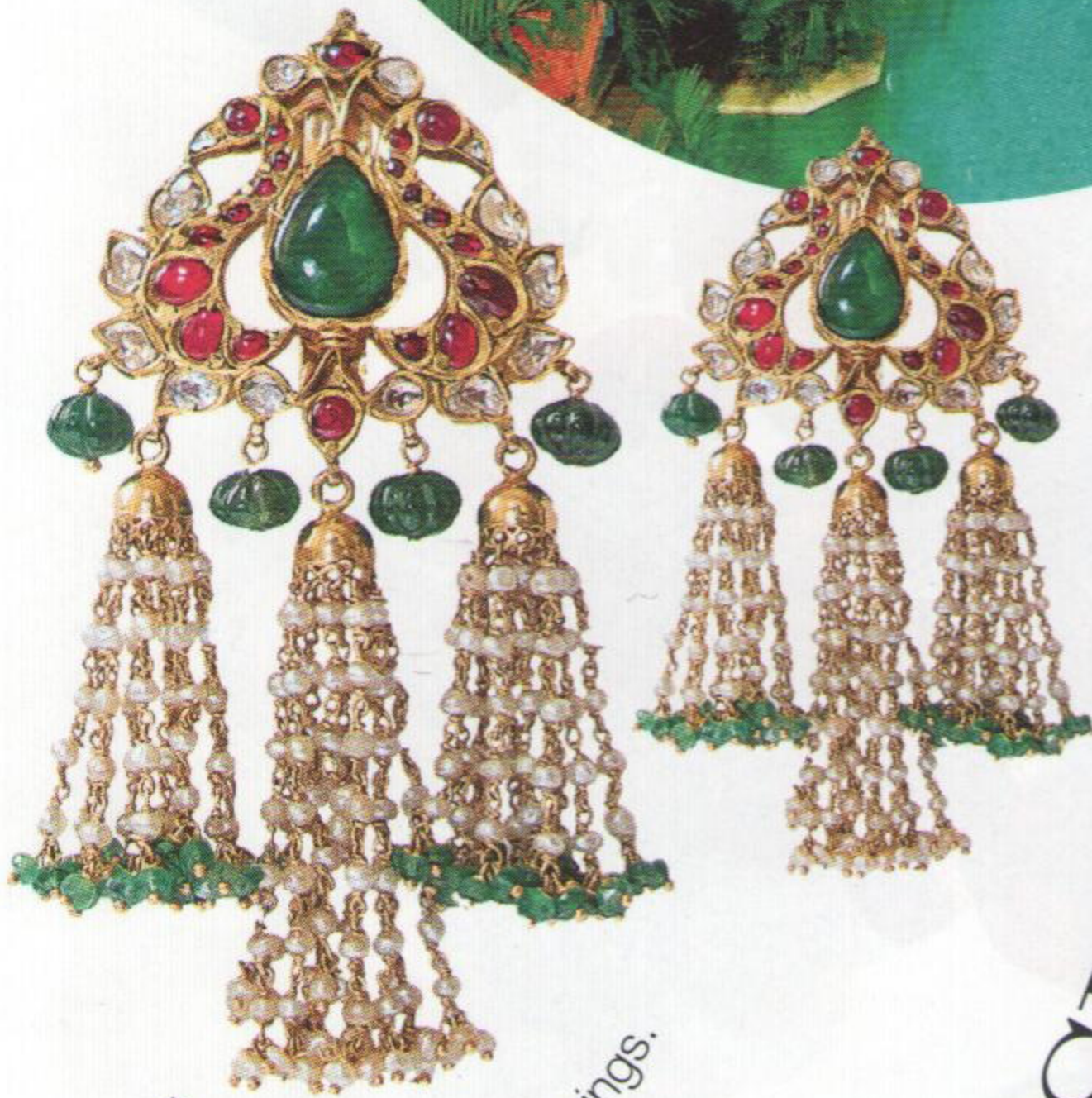
Falguni Mehta earrings.