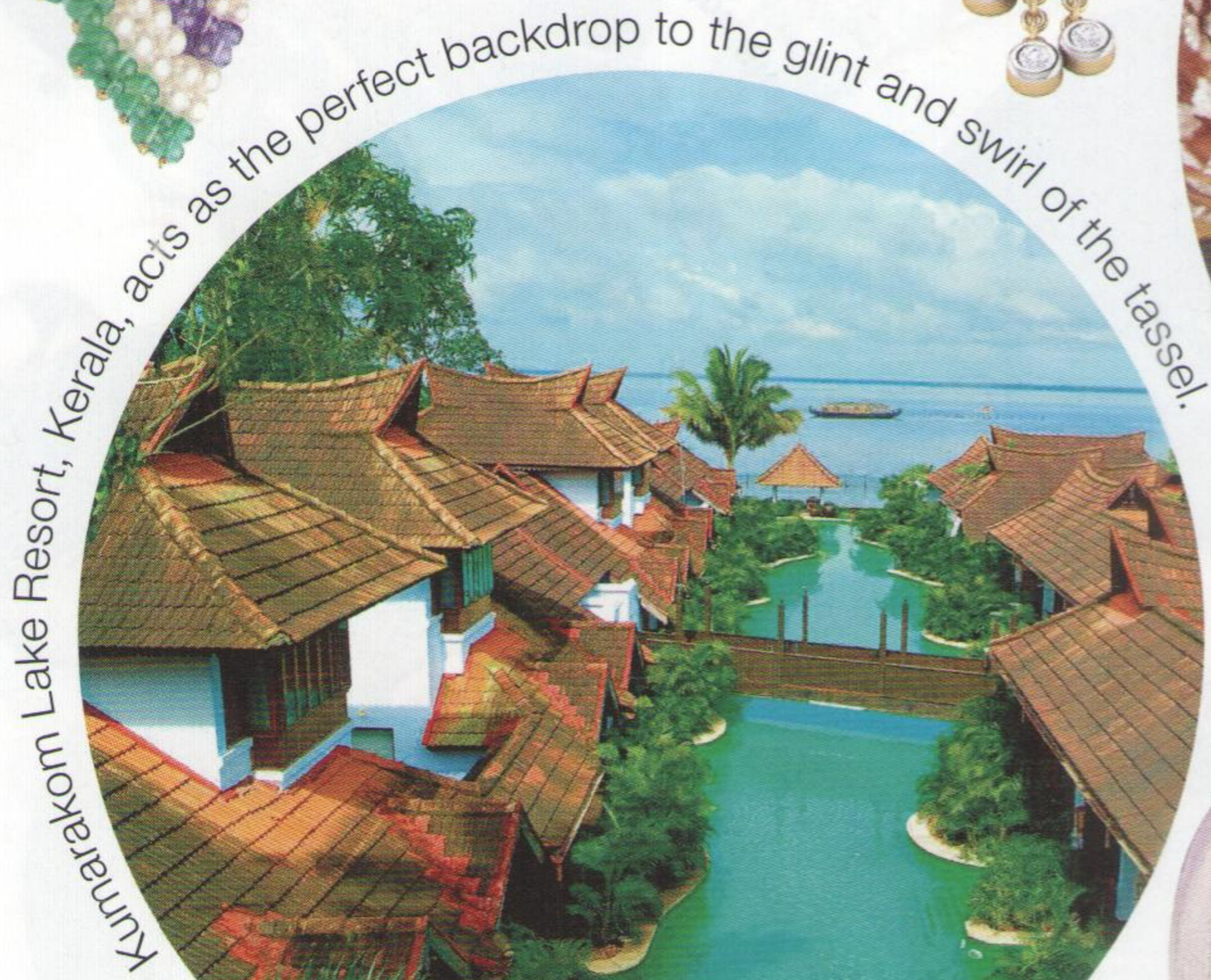
Kumarakom Lake Resort, Kerala, acts as the perfect backdrop to the glint and swirl of the tassel.