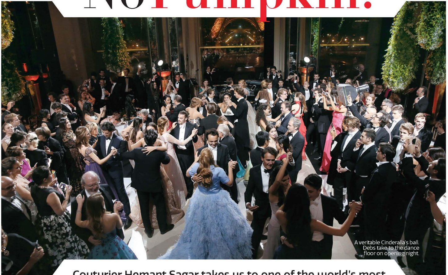
A veritable Cinderella's ball. Debs take to the dance floor on opening night.

Couturier Hemant Sagar takes us to one of the world's most glamorous events, the annual Bal des Débutantes in Paris, that sees a smattering of debs from all over the world – from European aristocracy to business royalty – for a ringside view of a fairytale evening of haute couture and brilliant jewels.