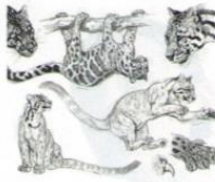
Big Cats of Fashion — page 14