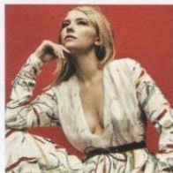
Star On The Horizon — page 50