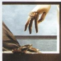
Caesar's Room — page 88