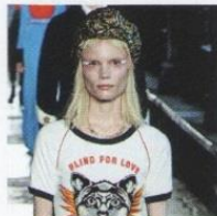
Try The Dye — page 49