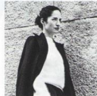
The Good, The Bad & The Naughty — page 16