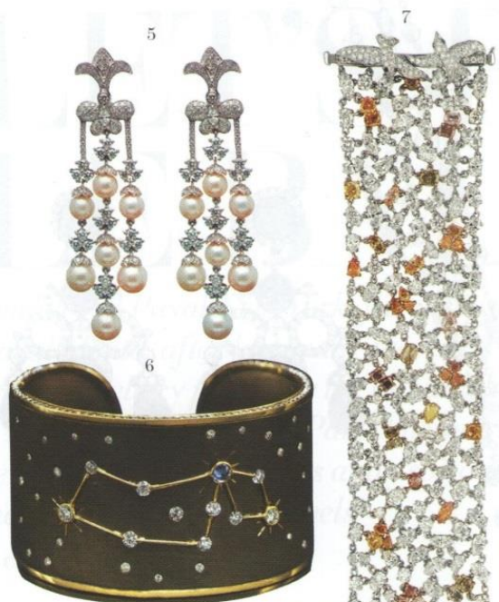
5. PEARL & DIAMOND EARRINGS. 6. CONSTELLATION CUFF. 7. MIXED DIA SHAPE BRACELET.