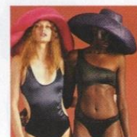
Hat Tricks — page 84