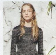
I Got Your Back — page 58