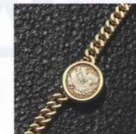
Geometric Elements — page 102