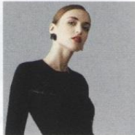
Things I Love — page 5