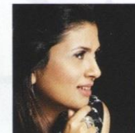
Let's Play Le Bal — page 98