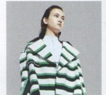
Stripe Struck — page 22