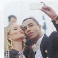
How The World Of Fashion Changed With #Olivier_Rousteing — page 60