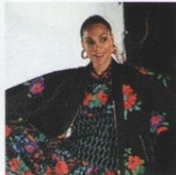
Time To Roar — page 31