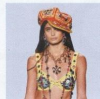
A Pendant For Pendants — page 97