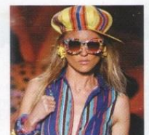
Hello Sunshine Girl — page 85