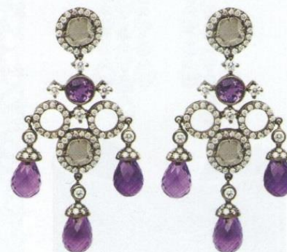
1. BIRD EARRINGS. 2. BIRD CAGE RING. 3. LOTUS NECKLACE. 4. DIAMOND SLICE AND AMETHYST EARRINGS.