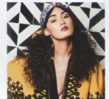
Lure of tropical Luxe — page 62