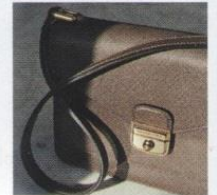
The Pliage "Heritage Besace" By Longchamp — page 48