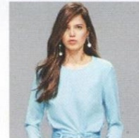
Feeling Blue — page 20