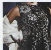
Grace Of Lace — page 74