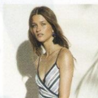
Thread Walk — page 73