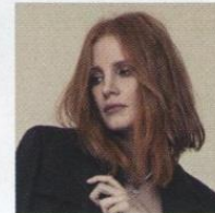
A Beautiful Mind — page 42