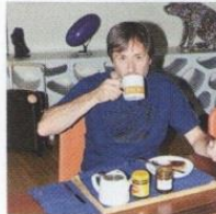
Morning Tea — page 30