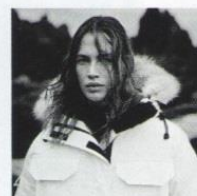
Braving All Weather — page 82