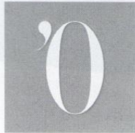
Editor's Note — page 4