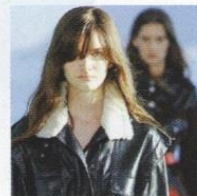
Time To Make A Statement — page 59