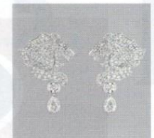
Fiery Lights — page 110