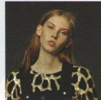
The Bold and The Minimal — page 34