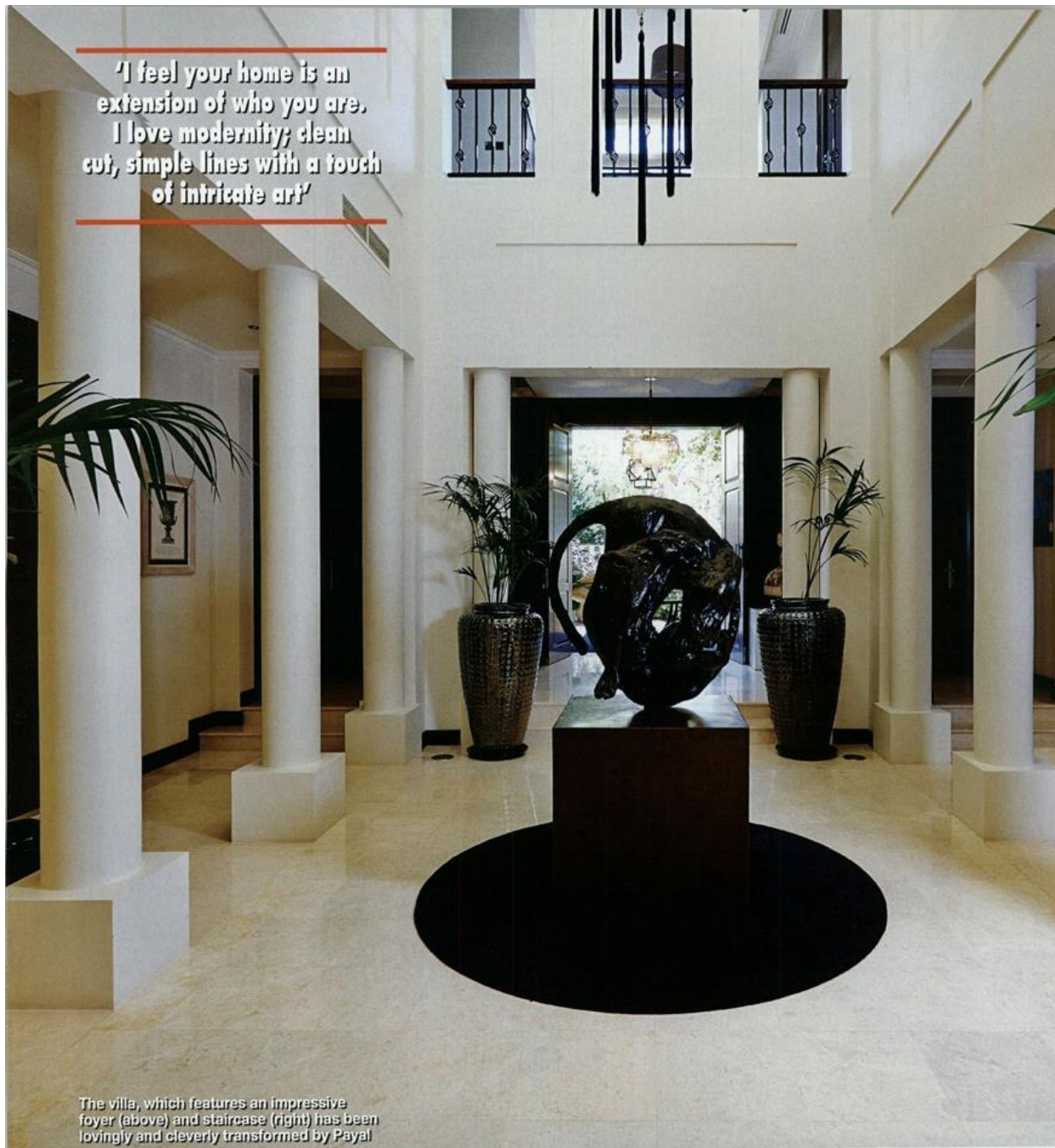
The villa, which features an impressive foyer (above) and staircase (right) has been lovingly and cleverly transformed by Payal

'I feel your home is an extension of who you are. I love modernity; clean cut, simple lines with a touch of intricate art'