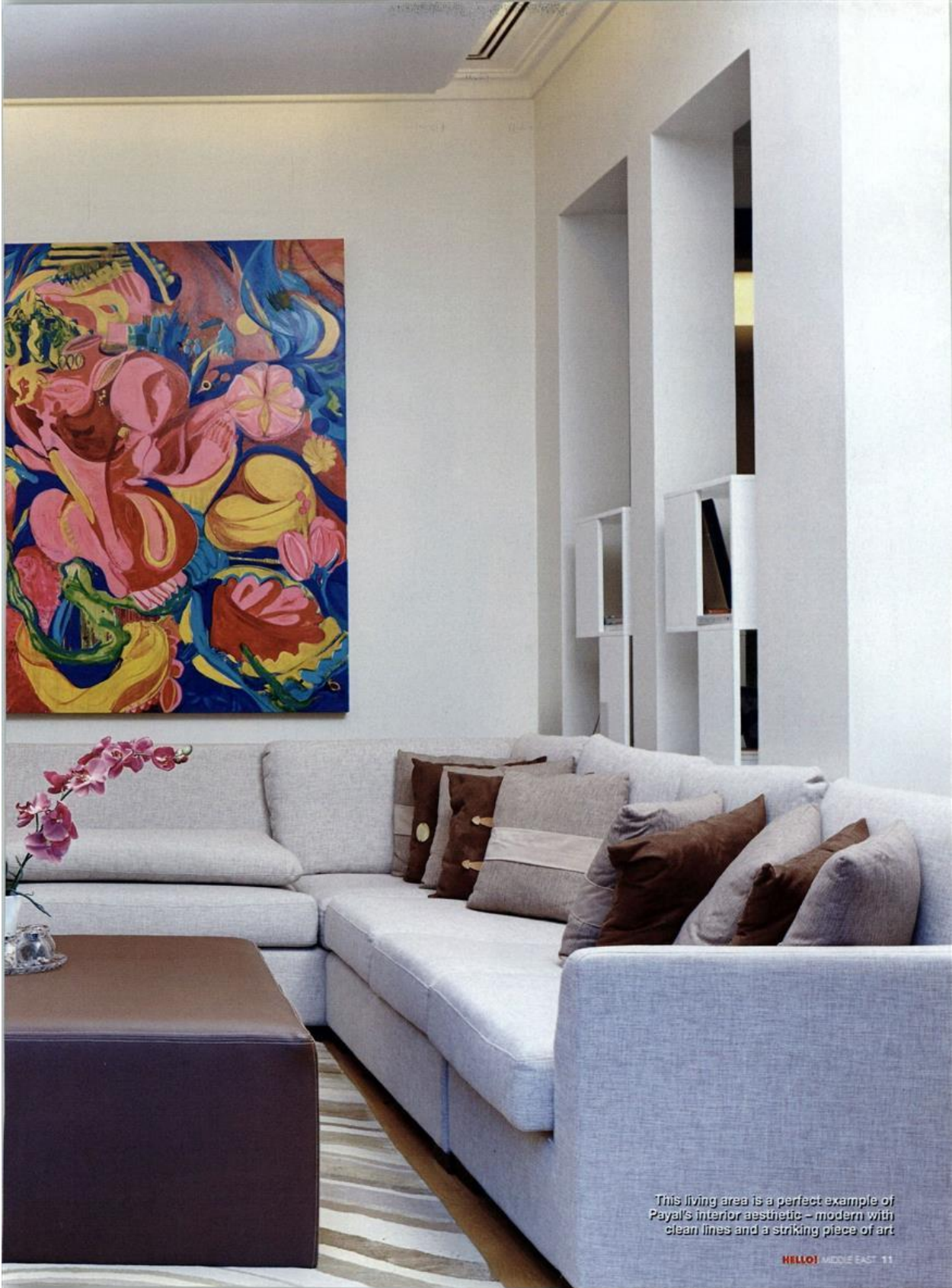
This living area is a perfect example of Payal's interior aesthetic – modern with clean lines and a striking piece of art